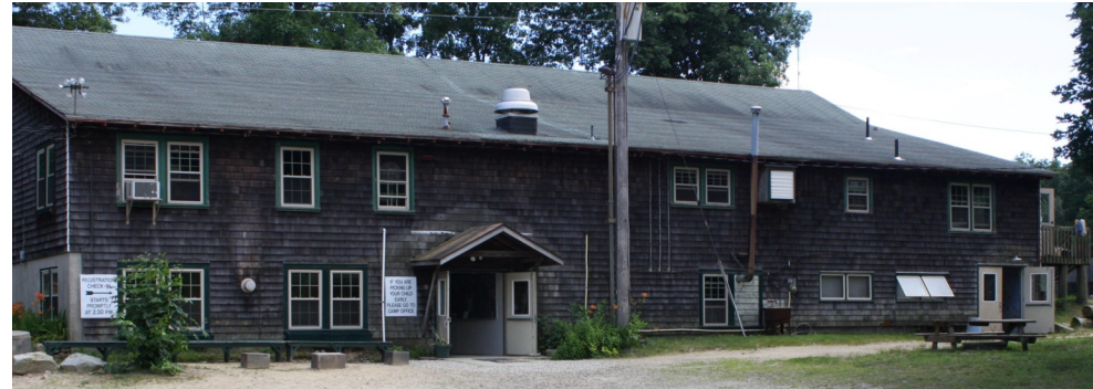
Current rear view of lodge

Questions? Contact us at 1-860-974-3379 or wc4hfounders@earthlink.net . A member of our volunteer board of directors will gladly return your call.